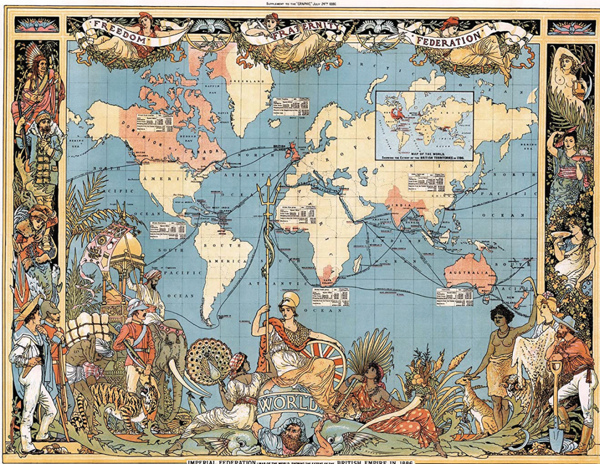
IMPERIAL FEDERATION - MAP OF THE WORLD SHOWING THE EXTENT OF THE BRITISH EMPIRE IN 1886. STATISTICAL INFORMATION FURNISHED BY CAPTAIN J. C. R. COLLETT, R.F. FORMERLY R.V.A. BRITISH TERRITORIES COLOURED RED.